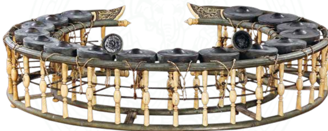
The Gong Wong Yai