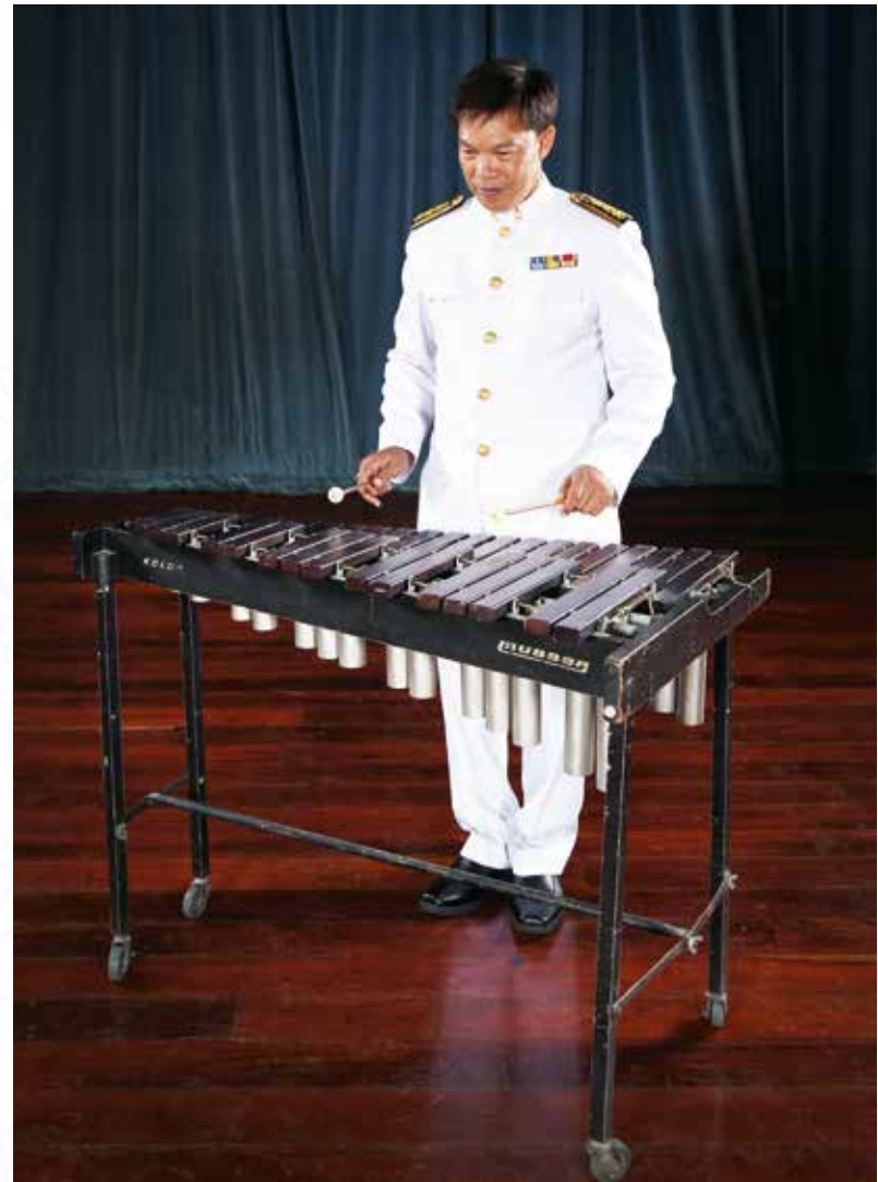
The xylophone, the western instrument most closely corresponding to the Ranard Ek.

In order to prove this theory practically, we will now play the Western diatonic major scale on a Western musical instrument. Please observe each scale-step by listening attentively in order to be able to compare them with the scale-steps of the Thai diatonic scale. In the ascent, the Western musical scale consists of 2 consecutive steps of full tone followed by one step of semitone, then 3 consecutive steps of full tone followed by another step of half-tone; we now arrive at the top step which is the octave above the first step; thus:-