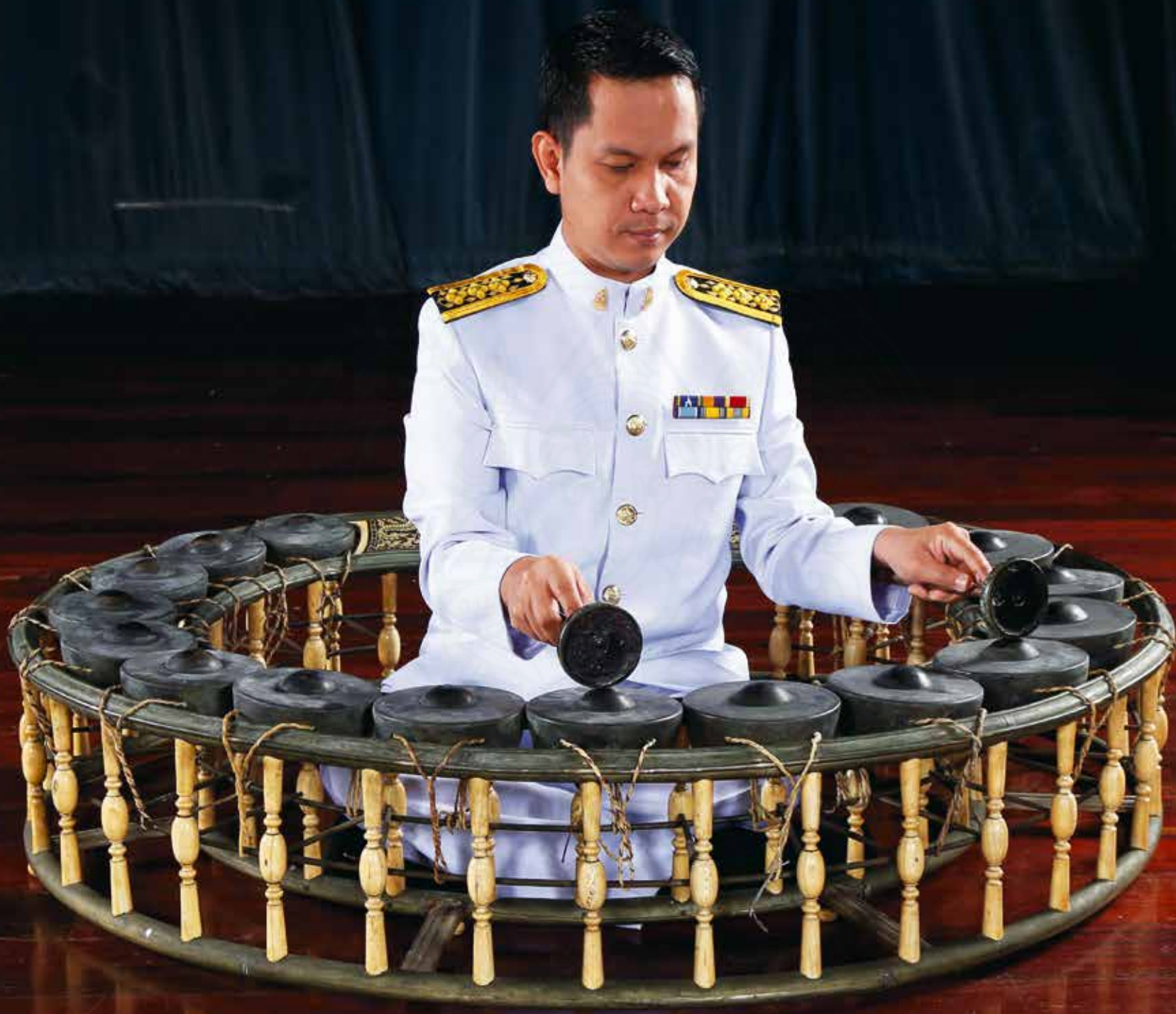
The Gong Wong Yai.