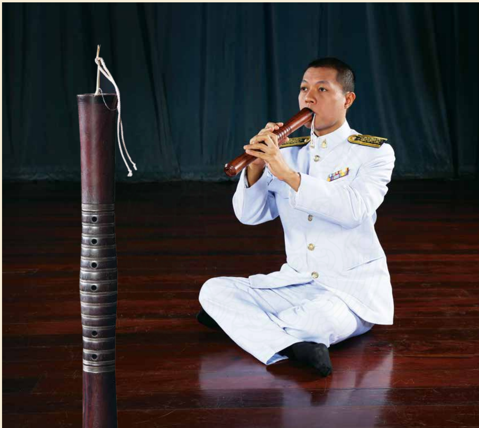
The Pi Nai