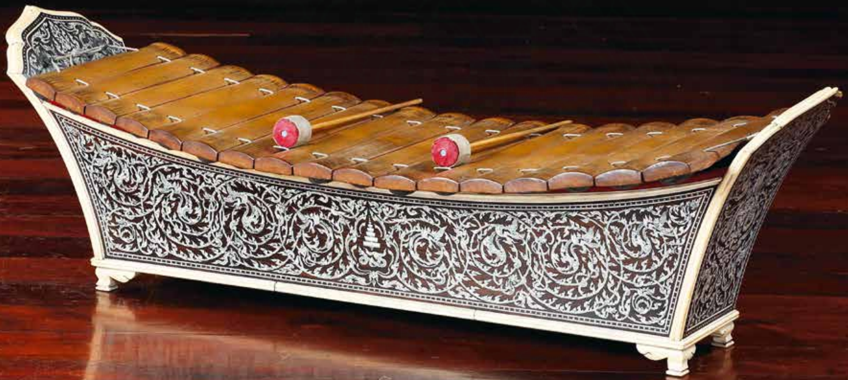
The Ranard Thum