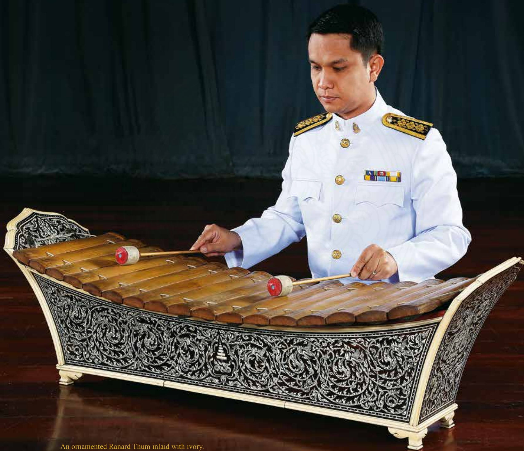
An ornamented Ranard Thum inlaid with ivory.