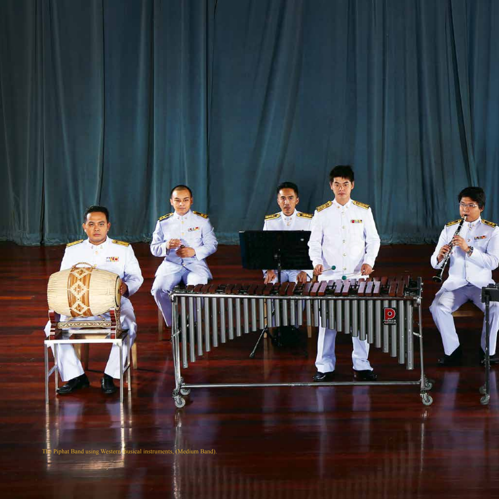
The Piphat Band using Western musical instruments, (Medium Band).