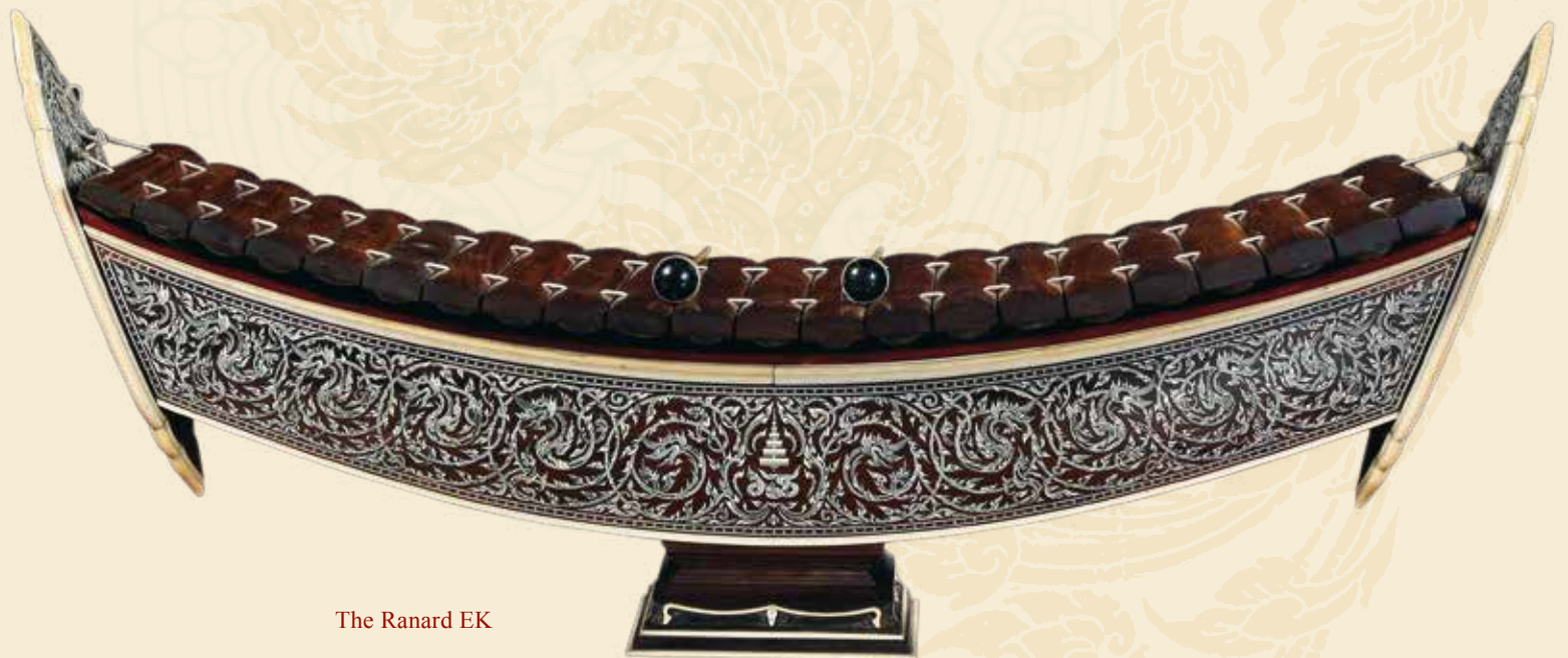
The Ranard EK

former Professor of Music, The Fine Arts Department, Bangkok, was one of the most prominent figures in the Thai musical circles. He received his musical education from his father. He was eminently responsible for the tremendous strides made in Western music in this country in his capacity as instructor and conductor. Phra Chen Duriyanga's great contributions to the cause of Western music dated as far back as King Vajiravudh's Reign when he was in charge of the Royal Orchestra, the first of its kind in Thailand and at that time the best in the Far East. A great music teacher, at whose feet most of Thai exponents of Western music. He also made great contributions to both Thai and Western music including the notation of Thai music, for which the achievement alone would perpetuate his name in the history of Thai music.