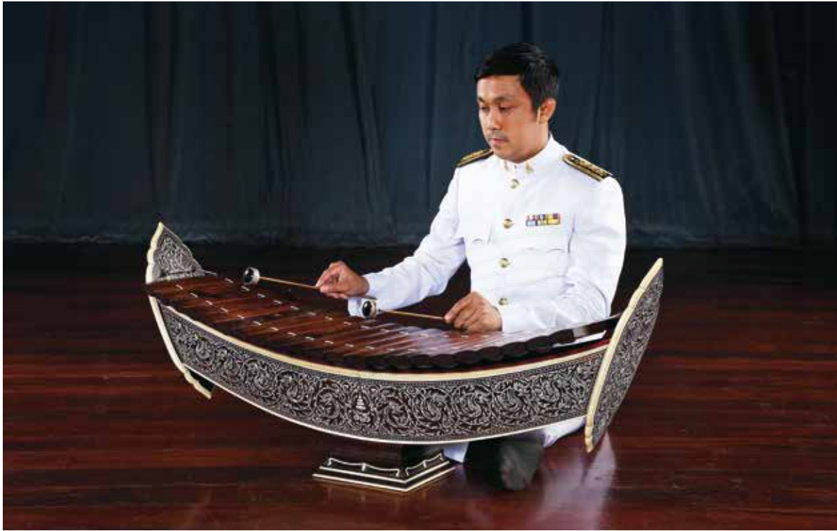
An ornamented Ranard Ek inlaid with ivory.