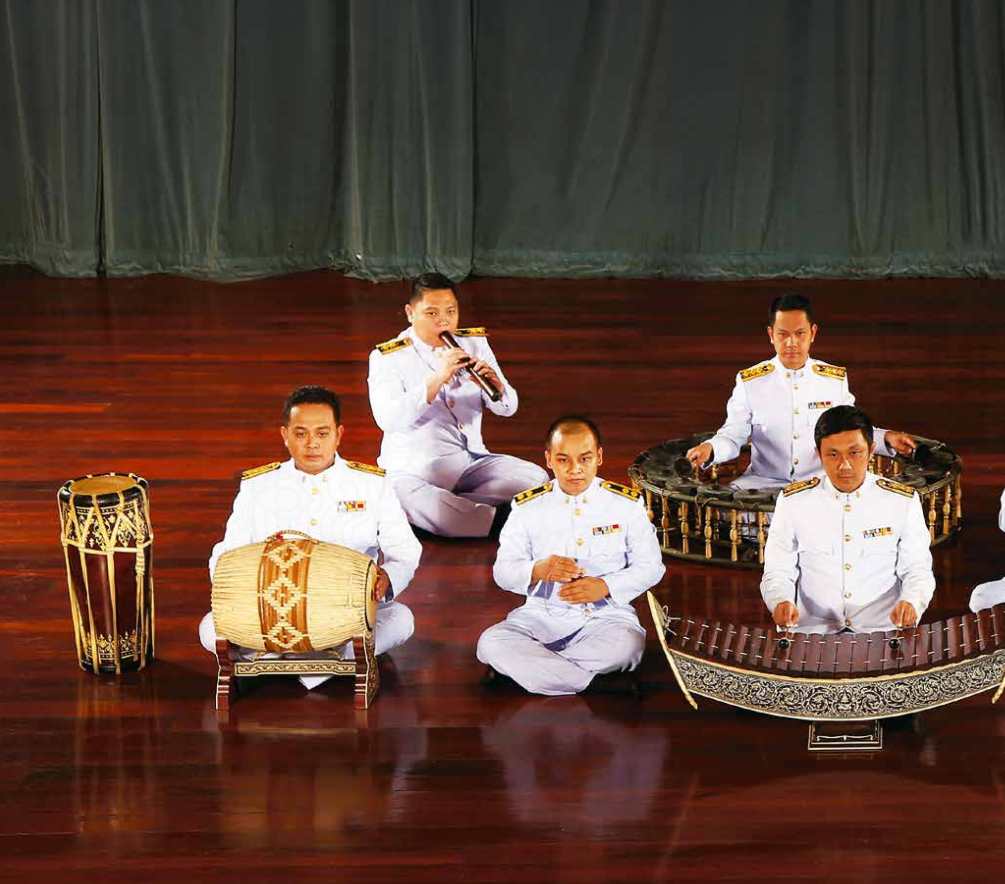
The Doubled-Piphat Band (Medium Band) of the Fine Arts Department during a Royal ceremonial performance.